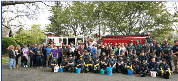
The Good Cemeterian Project – St. Ann's Cemetery