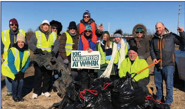
Keep Islip Clean - February 2019