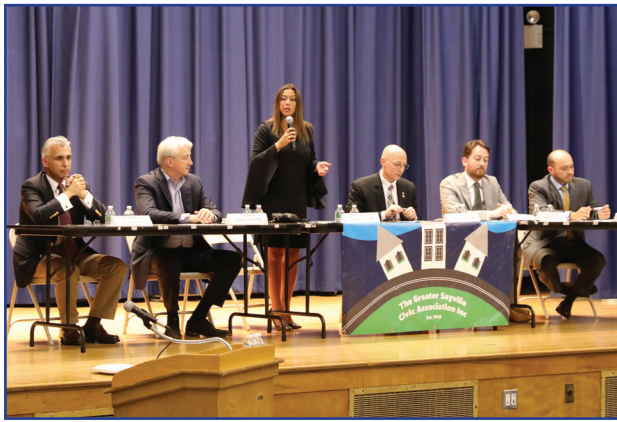
Meet the Candidate Forum