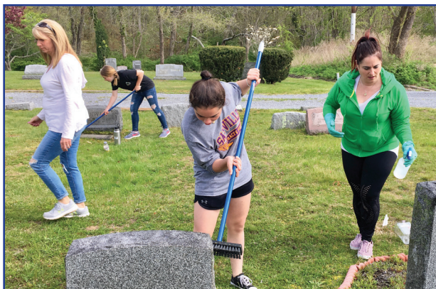
The Good Cemeterian Project – St. Ann's Cemetery