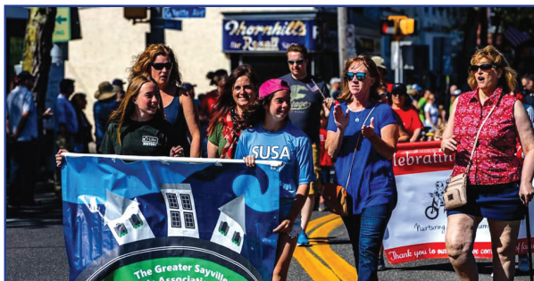
Memorial Day Parade 2019