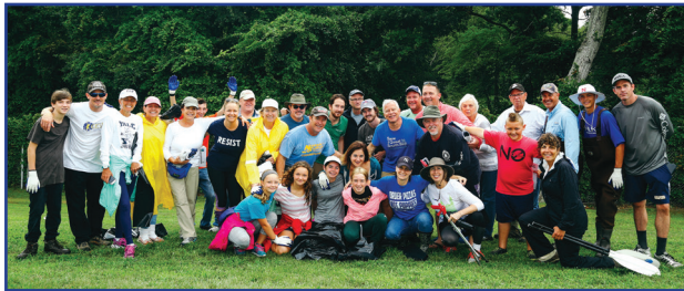
Local Creek Clean Up